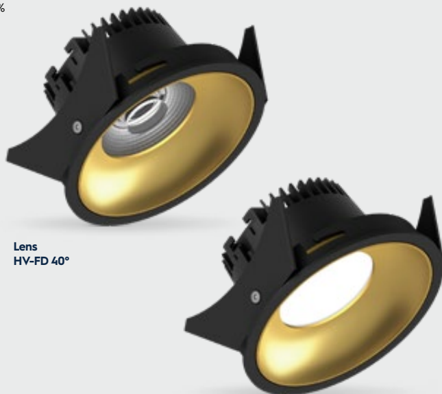
Lens HV-FD 40°